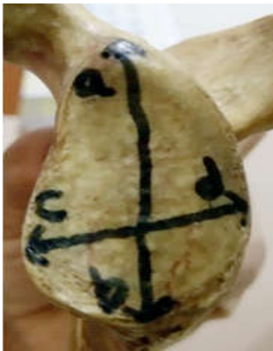
Fig. 2: Dimensions of glenoid cavity

Following measurements were taken in millimetres.